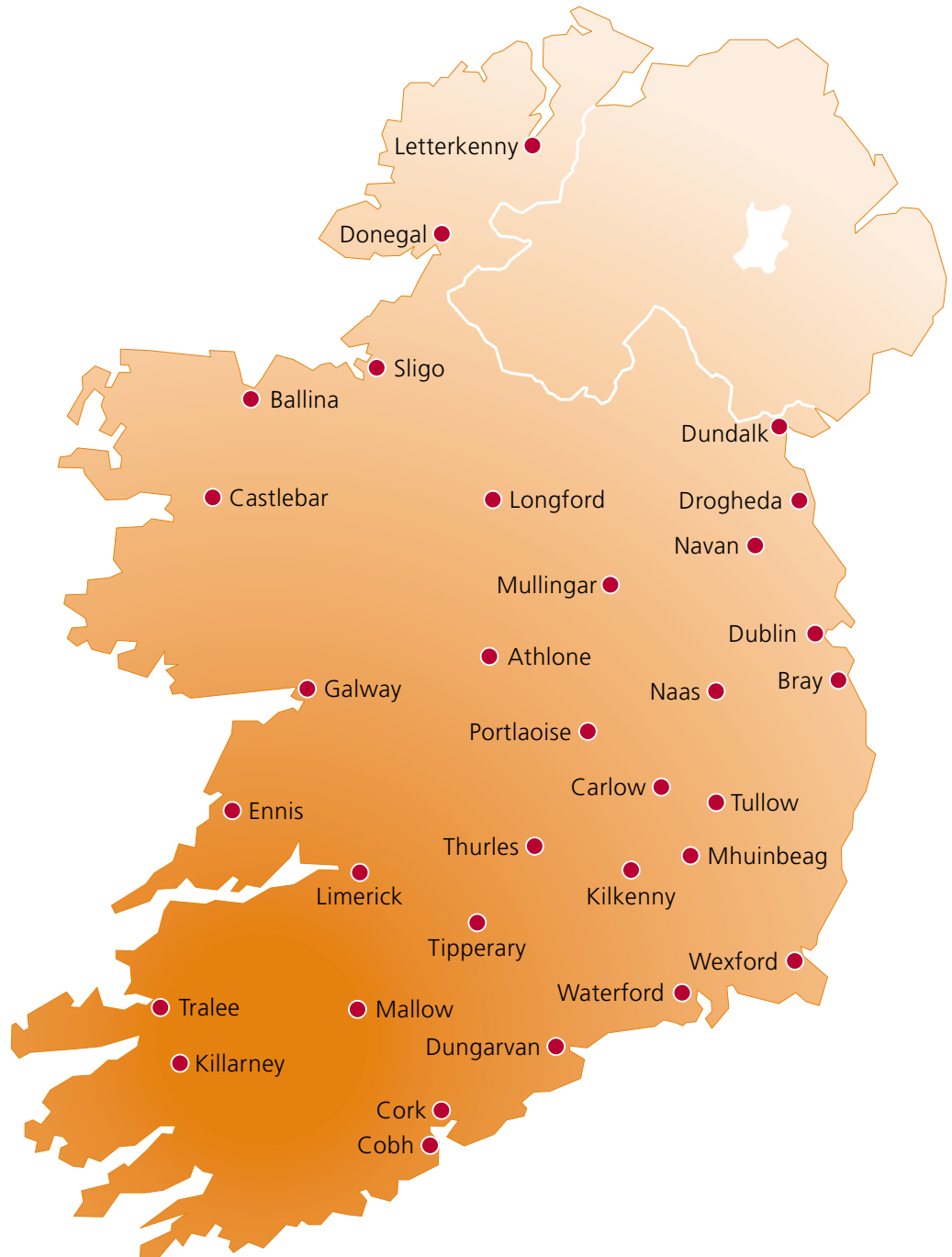
Figure 4.1: Towns with taximeter areas